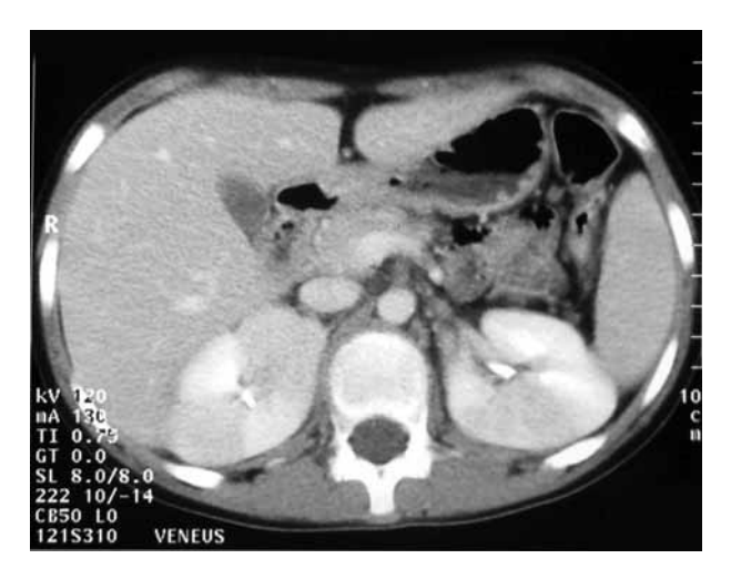
Fig. 1. — CT-scan demonstrating wedge formed lesions in both kidneys.

several reports have linked mesalazine therapy to acute and chronic interstitial nephritis (2,3,6-14). However, pancreatitis, skin reactions, hepatitis and blood dyscrasias have also been reported (17). Most cases are diagnosed within the first 12 months of therapy (5). Yet some reactions appear as late as 5 years after the start of mesalazine (11). This patient was taking a slow release preparation of mesalazine for 3 years.